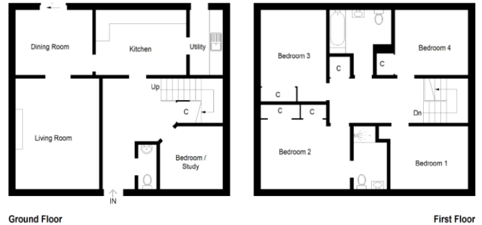
Illustration For Identification Purposes Only. Not To Scale (ID474754 / Ref:67257)

Very energy efficient - lower running costs